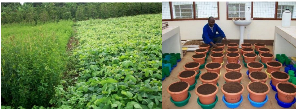
Figure 2: Crotalaria and Canavalia green manure plants (left), setting the screenhouse experiment (right)